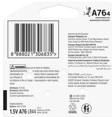
Back of pack (Affected stock)

For ongoing sales with visible keep out of reach symbol