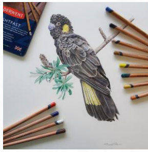
Black Cockatoo Derwent Lightfast Pencils 12 Tin