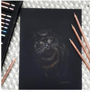
Black Cat Derwent Metallic Pencils 20 Set