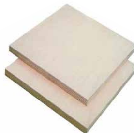
A small piece of wood