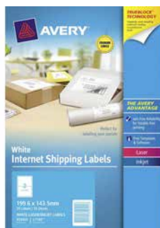
A pack of A4 sticky label sheets